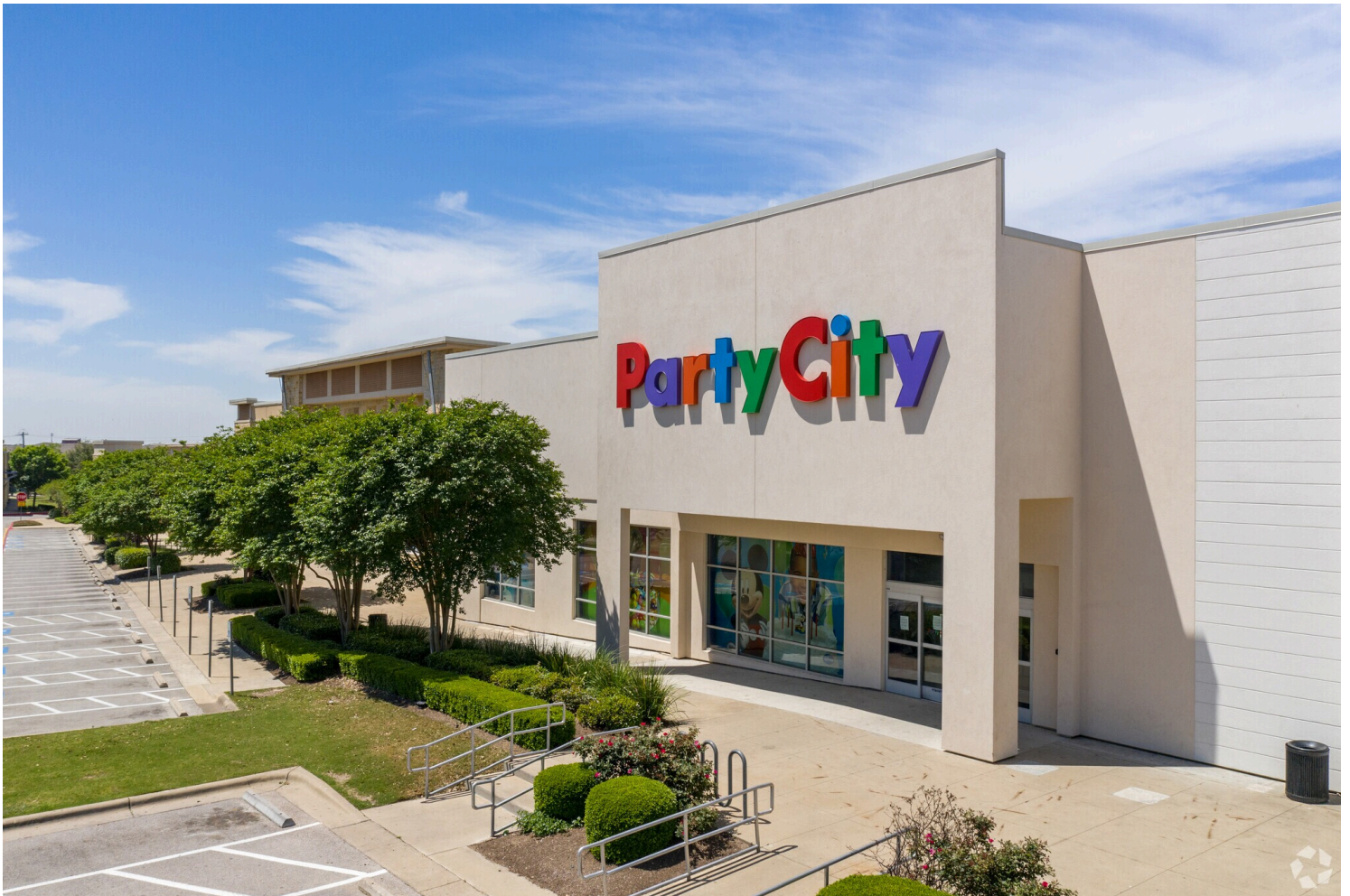
Party City is said to be planning to wind down its business.

New Jersey chain would become latest retailer to close all its stores